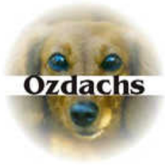
Ozdachs for Common Sense Web Design

Not all companies want to grow or think they can handle additional work! Because websites do generate business, you have to decide that you want the extra customers.